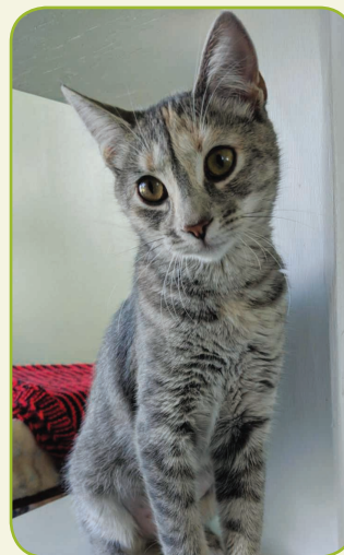
At only 6 months of age, little Spitfire, a kitten herself, could have had a litter already!

Many people are surprised to learn that more than 1.5 million cats and dogs are euthanized in U.S. shelters annually. We can do our part here in Vermont by preventing overpopulation. Please spay/neuter your pets — talk with your vet. VT-CAN! is a low cost option, check them out at www.vt-can.org .