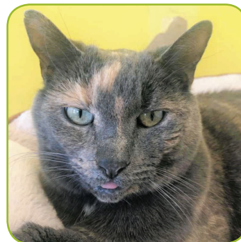
Here Rose is doing what is called a "blep" with her tongue, which happens when cats have no teeth!

W e all know what it is like to have a painful tooth. Can you imagine having an entire mouth full of painful teeth? This was the case for poor Rose. Every pet gets an initial medical exam as soon as they come in to CVHS. When we examined Rose, we immediately knew her teeth were in rough shape. We sent her to our friends at Bradford Vet, and they discovered that nearly all of her teeth were severely decayed. She must have been in terrible pain! After Rose recovered, she was a different kitty. Before her dental, she was a recluse, hiding all the time. After, she sought out head scratches and rubbed against people, purring away, quickly getting adopted into a loving home. What a difference dental care made for this kitty! At 13 years old, this might be the first time in years Rose has not been in pain. We strongly believe that dental care is vital to the health and happiness of