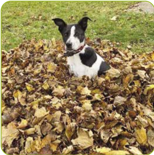
Val loves her leaf piles!

NONPROFIT ORG US POSTAGE PAID BURLINGTON, VT Permit No. 165