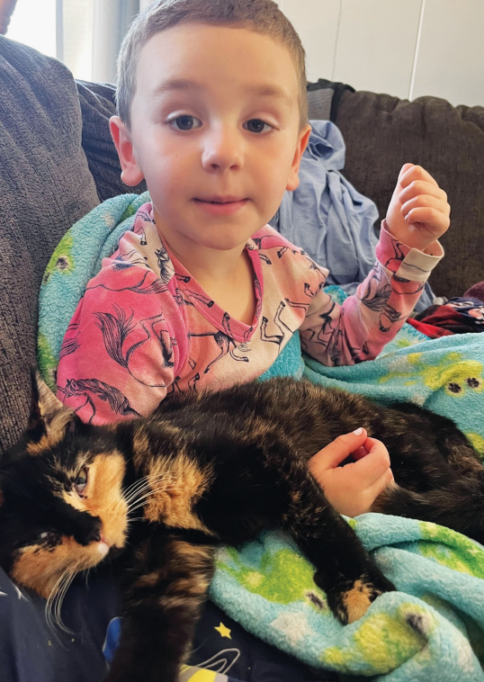
Brooklyn loves to snuggle!