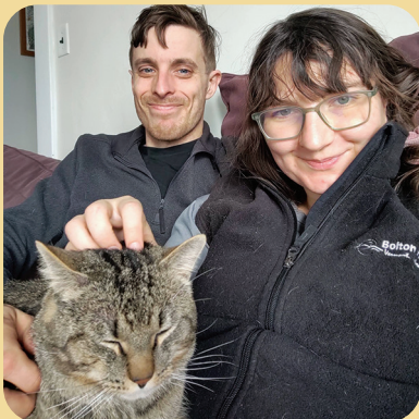
Timber's family thinks he is darling.

www.instagram.com/ centralvermonthumane/