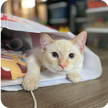
Holidays are Lily's favorite time!

NONPROFIT ORG US POSTAGE PAID MONTPELIER, VT Permit No. 61