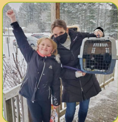
Mr. Waffles has a new and enthusiastic family!