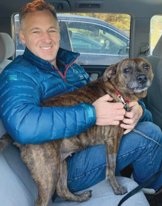
Brownie leaves for his new forever home.