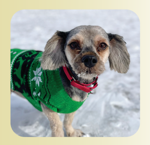
Help 475 local Vermont families and pets who needed us

Take in and provide loving care for 780 pets