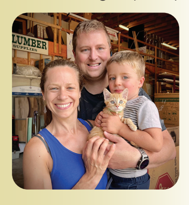
Most of all, we are thankful for the 2,058 individuals and local businesses who donated to CVHS this year to make all of this possible!

Care for 304 pets through our foster families who increase our lifesaving capacity